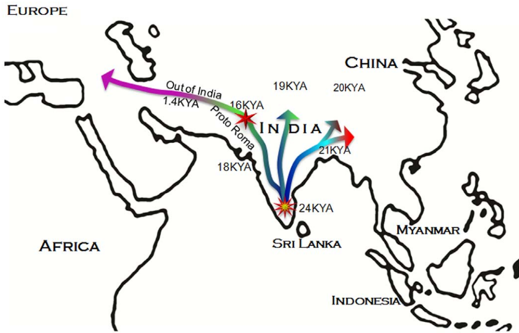
Figure 1. The most parsimonious route of prehistoric expansion of Y-chromosomal haplogroup H1a1a-M82 and the recent out-of-India migration of European Roma ancestors. doi:10.1371/journal.pone.0048477.g001

The geographical distribution of hg H1a1a-M82 is largely restricted to South Asia, and its significant occurrence among European Roma populations strongly links the Roma to the Indian subcontinent. The high frequency of H1a1a-M82 among all the Roma groups and their reduced genetic diversity relative to South Asian populations can most likely be attributed to their recent migration from India (Table 1 and 2). In the network analysis (Fig. 2), the Roma Y-STR haplotypes cluster predominantly close to the northwestern Indian haplotypes. In addition, the northwestern Indian haplotypes, while diverse, generally radiate from the core of the network while the Roma haplotypes being distributed further away. These patterns point to northwestern India as the source of the Roma H1a1a-M82 chromosomes. The average age estimate of Roma founders considering their distance from Northwest Indian founders is 1405 \pm 688 YBP